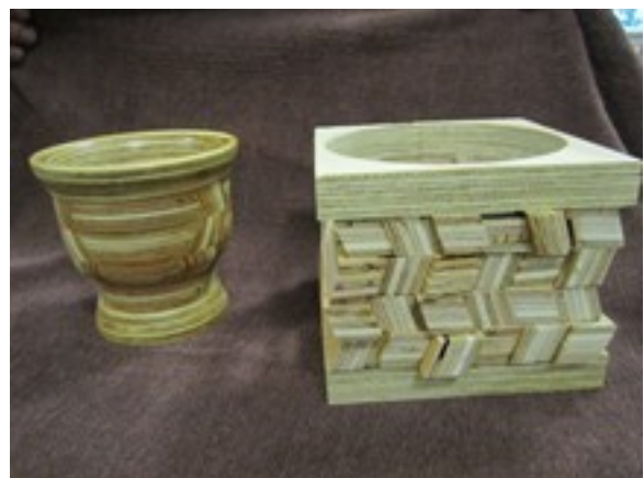
Russ's plywood laminated turning