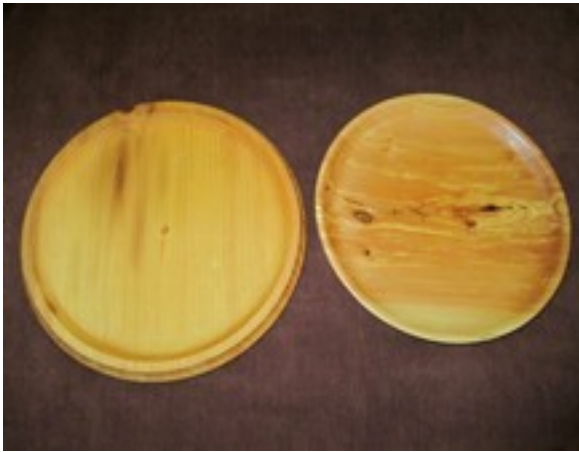
Peter Haney's paper plate holders