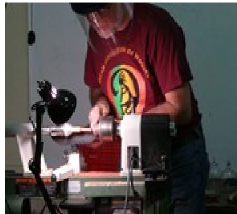
Finishing the turning on the stem