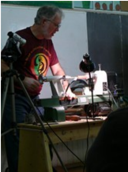
Drilling the hole for the stem