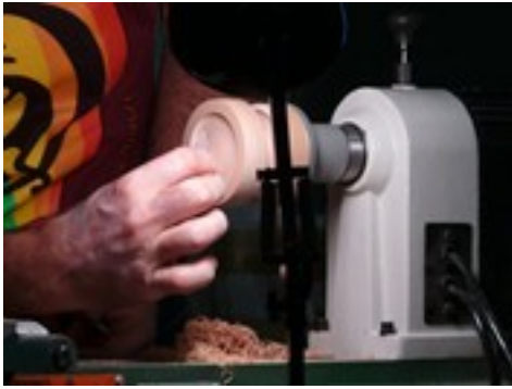
Sanding the underside of the base