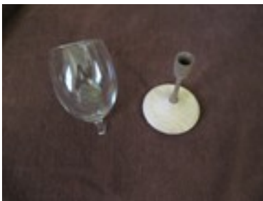
A completed stem/base