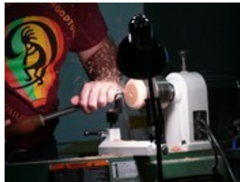
Turning the top of the base